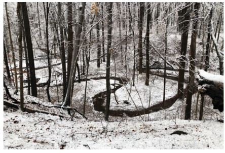
LuAnne Letizia Down in the Canyon

A small stream snaking along the canyon floor. Robb Hidden Canyon