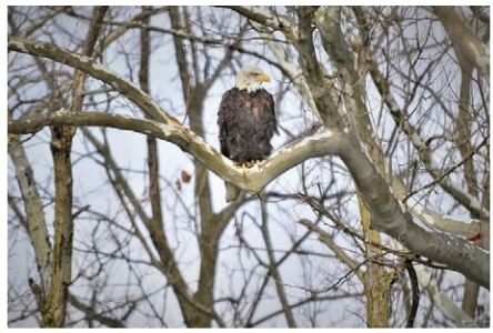
Watchful Guardian This eagle kept watch over the preserve. Seven Pillars Nature Preserve